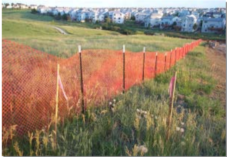
Photograph CF-1. A construction fence helps delineate areas where existing vegetation is being protected.

A construction fence restricts site access to designated entrances and exits, delineates construction site boundaries, and keeps construction out of sensitive areas such as natural areas to be preserved as open space, wetlands and riparian areas.